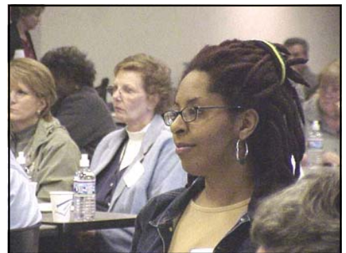
Workshop attendee participating in the Plenary Session on “Creating Walkable Commu-