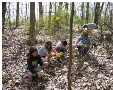
Youth Participating in Environmental Stewardship.