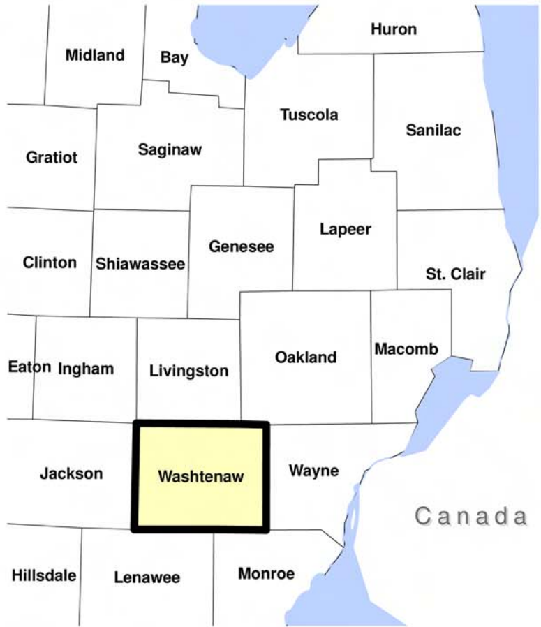
County Area Map Not To Scale