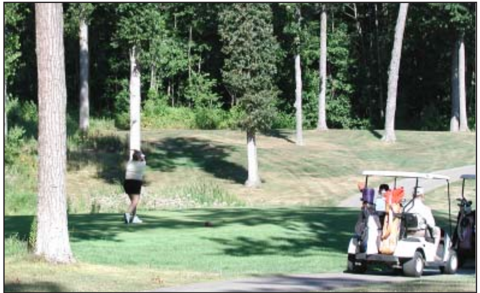
Can you identify which hole this golfer is teeing off from at Pierce Lake Golf Course?