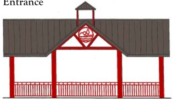
Drawing of the new Medford Shelter for County Farm Park

New facility development and park expansions, particularly larger ones and those responding to underserved populations, tend to be big news. However, needs confronting recreation systems are not solved through new development and facility expansion alone. Existing facilities must be kept in service in order to continue to provide adequate recreational opportunities for public use and enjoyment. While not as attention getting as a major new development, existing facilities must be routinely evaluated for needed maintenance, repairs and rehabilitation. Eventually there comes a time when replacement is required. Such is the case with the County Farm Park Medford Shelter, located at the Medford Road entrance to the park.