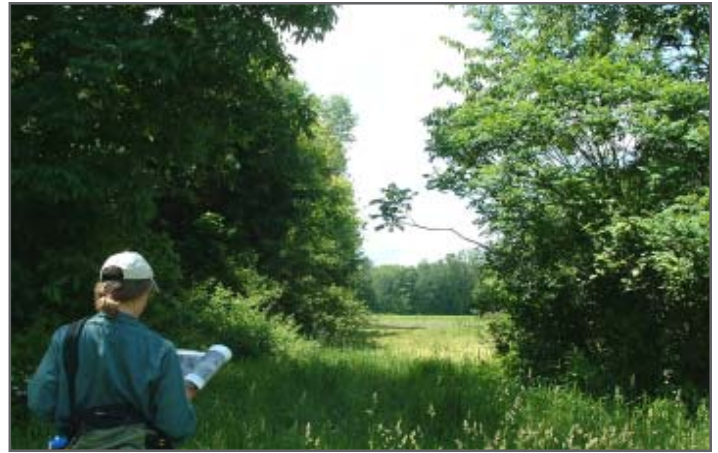
Scouting new trails at the Brauer Preserve in Freedom Twp