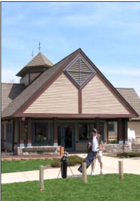
Frederick L. Barkley Golf Center