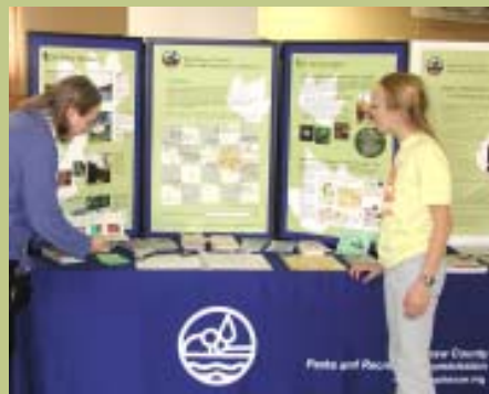
WCPARC booth at the fair

Currently, WCPARC is helping researchers track the spread and behavior of the invasive pest; removing significant infested ash trees and replacing them with native trees; trying different treatments to protect uninfested trees; and developing a program for getting kids involved in growing and planting "replacement" trees.