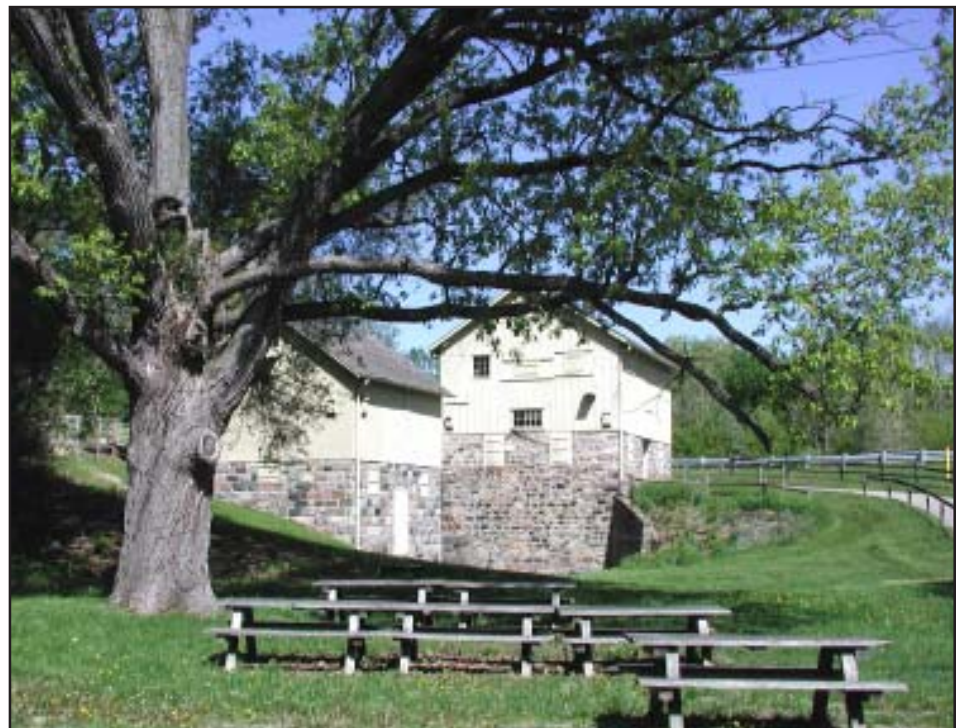
Today the Parker Mill buildings appear relatively unchanged from the late 1800s. In fact, new structural beams, siding and roofs, and conversion to an electric-powered turbine were among the extensive renovations commissioned by WCPARC in 1983. Historical authenticity was ensured by Amish craftsmen.