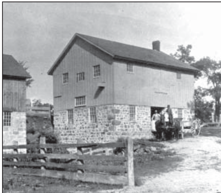
Loading bags of freshly ground flour onto a buckboard wagon at the lower level of the Parker grist mill (circa late 1880s)