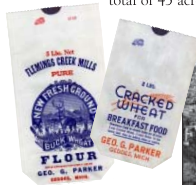
The Parker brand of "Flemings Creek Mills" flours, cereals and vinegars was sold at local stores