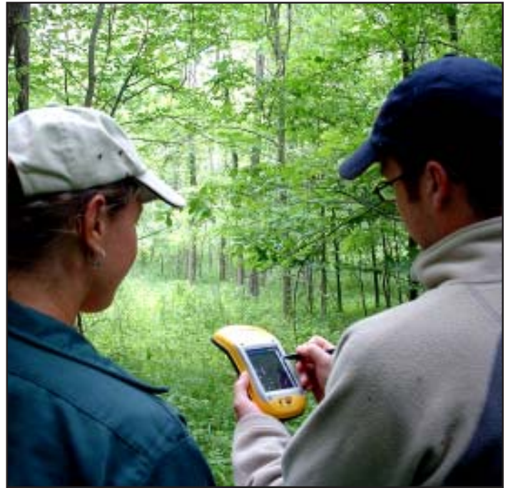
Parks Naturalists use GPS technologies to map rare and threatened species found in County natural areas

The Commission is also looking forward to increasing the size of several existing parks, further expanding recreational opportunities for County residents and visitors. Negotiations are proceeding and grant applications have been prepared for these exciting new additions to the parks system. Look for updates in our winter and future newsletters.