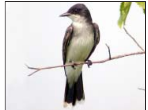
Great-crested flycatcher ( Myiarchus crinitus )

Ironically, the closing of the popular Delhi Bridge may be a blessing in disguise as it serves to further enhance Osborne's secluded charm. There is one short trail loop and a short trail that extends south to the property line. When you visit, please be considerate of our neighbors by not trespassing beyond