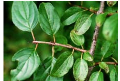
Honeysuckle ( Lonicera maackii , top) and buckthorn ( Rhamnus cathartica , bottom) are two of the invasive plants targeted.