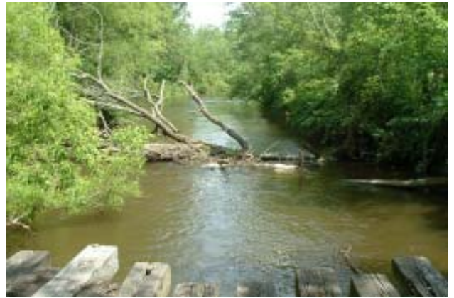
View from the River Raisin bridge at the Ervin Preserve, a recently purchased NAPP property, Bridgewater Twp.

Please remember to Vote on November 2, 2004. ♪