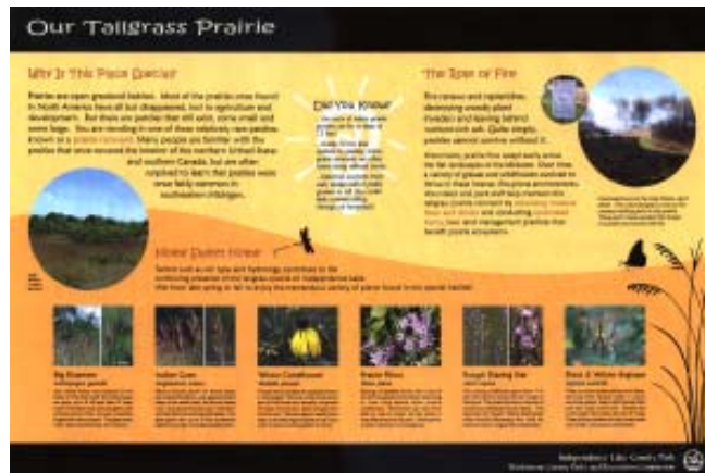
One of the six new interpretive signs in the park.