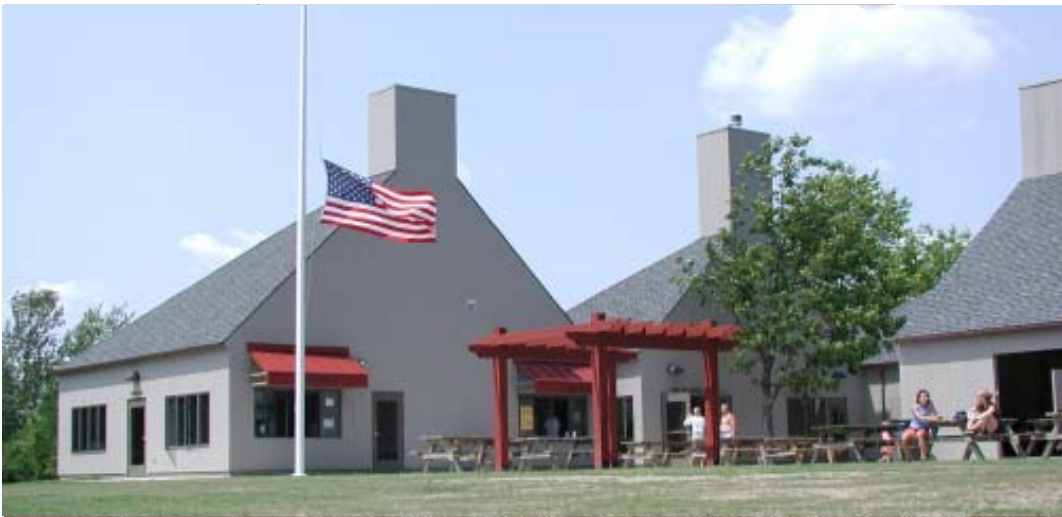
The new Beach Center at Independence Lake County Park