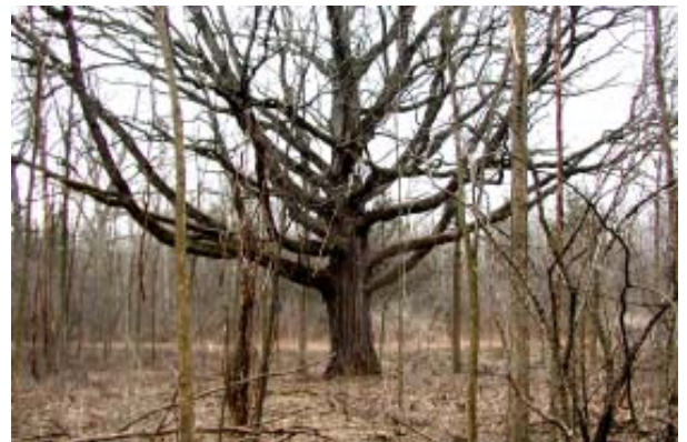
Freeing the Oak...these before and after pictures show how many invasive plants were removed!