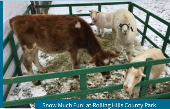
Snow Much Fun! at Rolling Hills County Park

Pre-Registration Required at parksonline.ewashtenaw.org