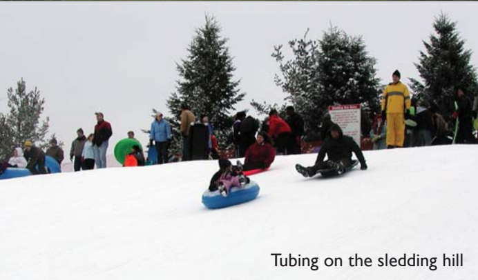
Tubing on the sledding hill