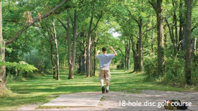
18-hole disc golf course