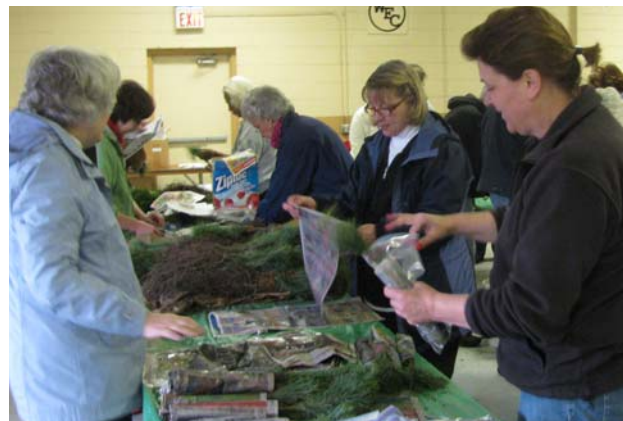
In preparation for Project RED, Master Gardeners participate in wrapping white pine saplings. Children at the event are given a sapling to plant in their yards.