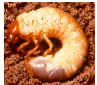
White grubs damage your lawn by feeding on turf roots.

So when you get your mower out this spring, you know what to do: Raise the mowing height to 3.5 inches.