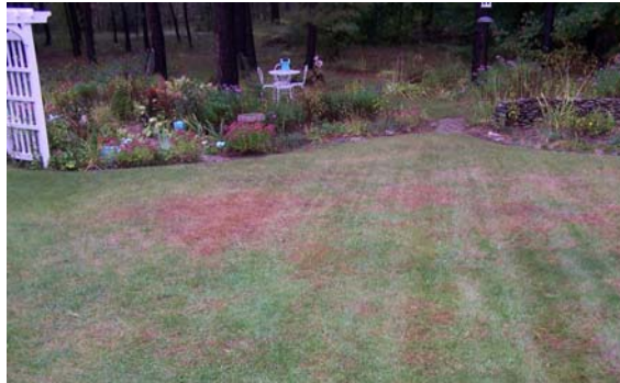
Grub damage may cause dead patches in a lawn.

Michigan residents treat their lawns with approximately $20 million worth of insecticides each year, most of which is used to avoid damage from European chafer grubs.