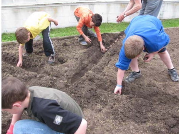
Enthusiastic JMGs place seed potatoes.