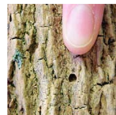
D shaped exit holes

When traveling in Michigan in areas out of the quarantine, be on the lookout for this serious pest. If you see the above symptoms on ash trees please report it through the toll-free Michigan Emerald Ash Borer hotline. Quarantine information can be found at the web site listed below.