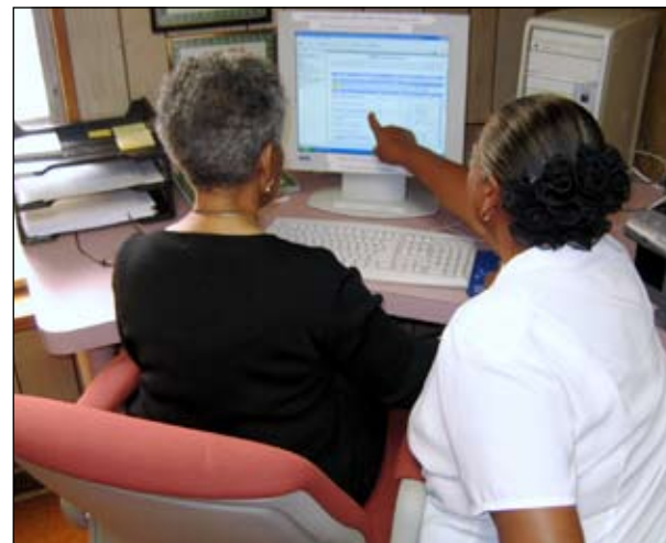
Ambassadors hard at work.

for use with Access Points. The computer becomes the partner organization's property. A spreadsheet is maintained with complete contact information from each partner, along with the beginning and ending dates for each MOU.