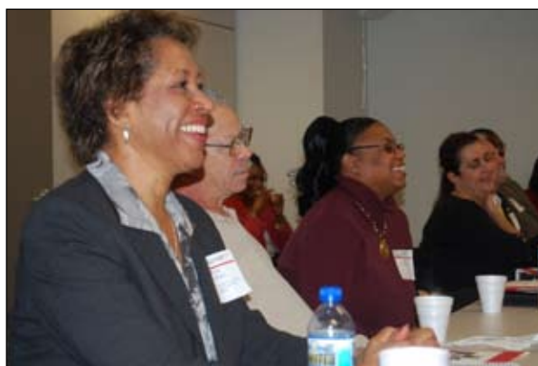
Access Points Annual meeting.

A Memorandum of Understanding is used to describe the relationship between ETCS and partner organizations, as well as services to be provided. Each location is given a computer