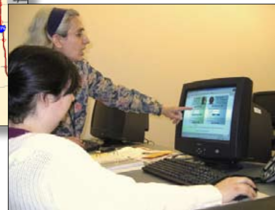
Ypsilanti Public Library Access Point.