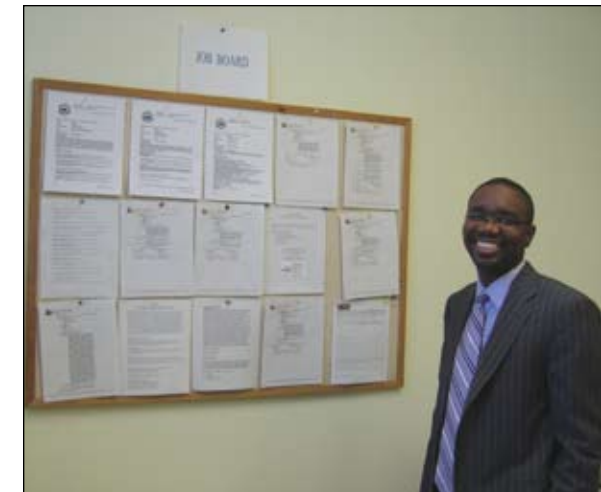
Access Points Ambassadors finds 100 new jobs!

All Access Point sites are open for a minimum of two hours per week. Some like community agencies are open full time. A number of the churches have volunteers available on Sundays following church services. Activity at each site is tracked via sign-in sheets and a sign with an Access Point logo is displayed at each location to help create an identity for the project.