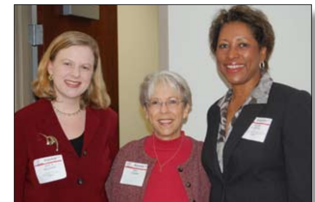
USDOL and MI Dept of Labor & Econ Growth Officials.