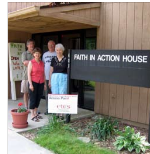
Faith in Action Access Point in Chelsea, MI.

In Washtenaw County-Faith and Community-Based Organizations have joined forces with Employment Training and Community Services (ETCS)/WASHTENAW COUNTY MICHIGAN WORKS! to create Access Points that greatly expand resident access to information about employment and training opportunities, as well as community services to address basic needs. No other community in the country has embraced the Access Points concept more than Washtenaw County. Since 2005, the U.S. Department of Labor's (US-DOL) Employment & Training Administration has been helping states implement both Access