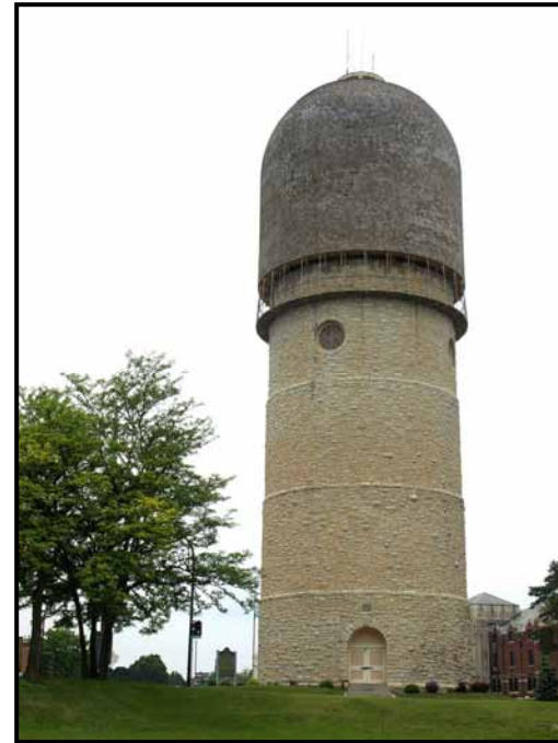
Ypsilanti City – Historic Water Tower

Ypsilanti City had no TMDL sites. It has five Part 201 Sites. It has six NPDES permits for storm water and two NPDES pollutant discharge permits. Ypsilanti City has 51 UST sites, nine LUST, and nine AST sites.