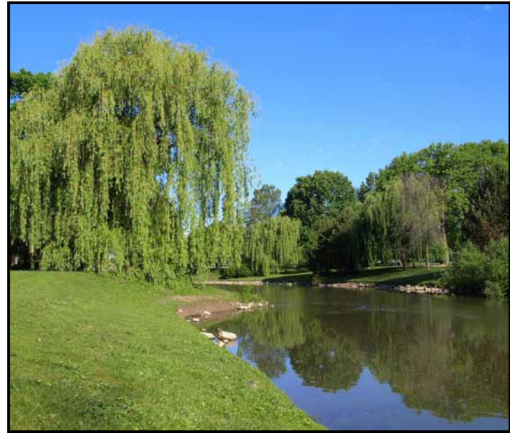
Milan City – Saline River

Milan City has no TMDL sites. It has two Part 201 Sites. It has no NPDES permits for storm water and no NPDES pollutant discharge permits. Milan City has six UST sites, three LUST, and two AST sites.