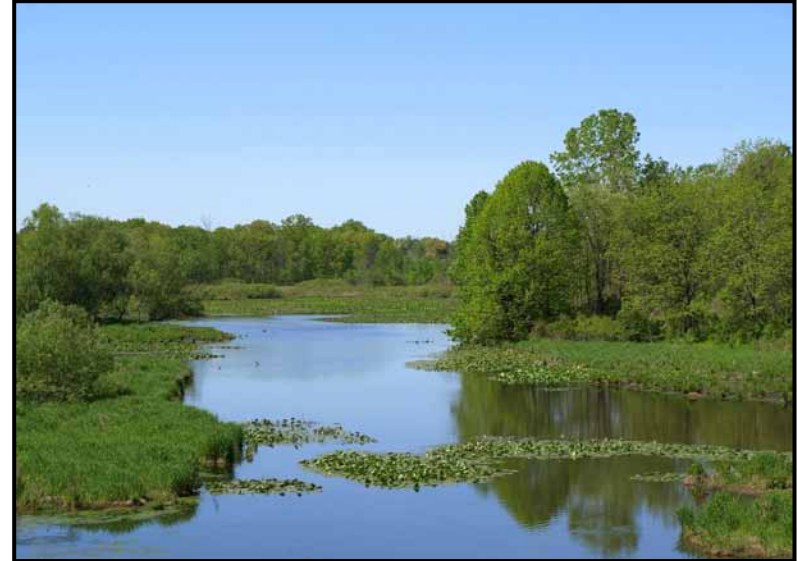
Dexter Village - Mill Pond

Dexter Village has no TMDL sites. It has two Part 201 Sites. It has five NPDES permits for storm water and two NPDES pollutant discharge permits. Dexter Village has four UST sites, six LUST, and one AST sites.