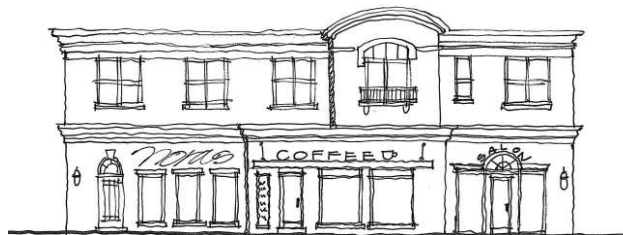
Figure 7.3 - 2-Story Building With Façade Articulation and a Defined First Floor