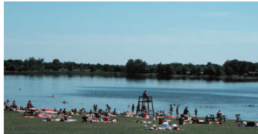
Independence Lake Park, one of the Washtenaw County's recreational facilities

Ypsilanti Townships manage their own local parks, and many other townships have parks and recreation commissions to plan for future needs.